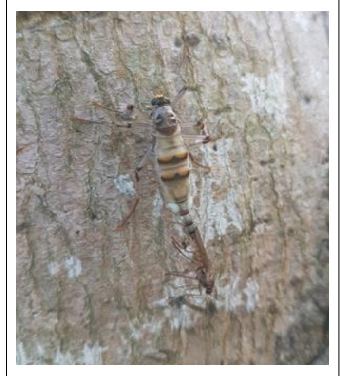
The photo shows a female (top) and male (bottom) Soldier Fly, whose larvae help break down leaf matter and debris. This species has pronounced sexual dimorphism, the large female is wingless while the tiny male has wings.

Each newsletter now will feature something of interest from the park. Ranger Katy spotted this?????