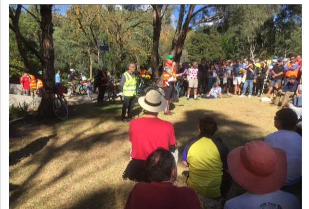
Graeme Martin, Community Coalition coordinator and Vic Roads representative address the crowd.

Plans for a Farm Road link for Alphington residents south of Heidelberg Road, to access the trail without having to cross main roads, are still in progress. With VicRoads, local government and LaTrobe Golf Course in support, it should happen in the not too distant furture!