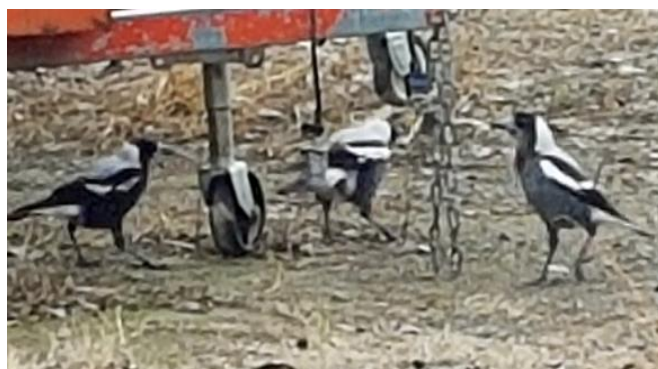
Exhibit A: The Gang at 50%

It's at this point I want to tell you about a gang of vandals who have been pulling out our plants!