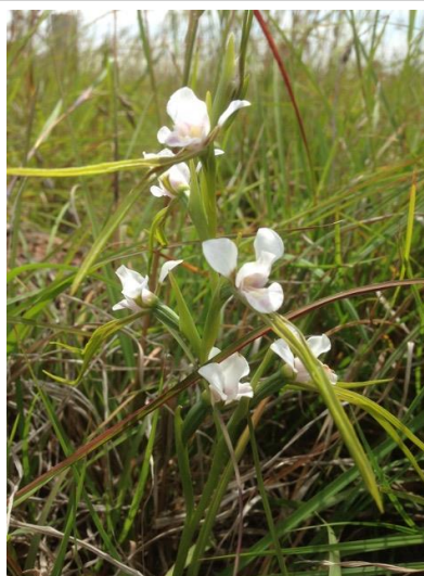
Photo: Sunshine Diuris orchid

We will start with drinks at the Clifton Bridge to celebrate its 40th anniversary, then a walk through the park and a BBQ tea