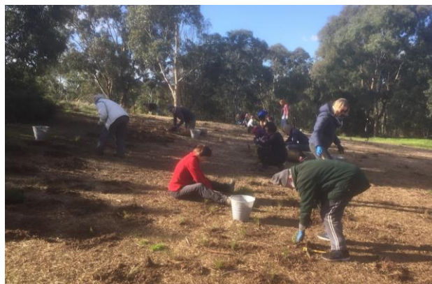
Mt Puffalo. Park Care Day July 2019

With this planting Mt Puffalo is nearly covered in grasses and wildflowers. Ranger Pete's vision of a hill shimmering with grasses in the wind is a reality.