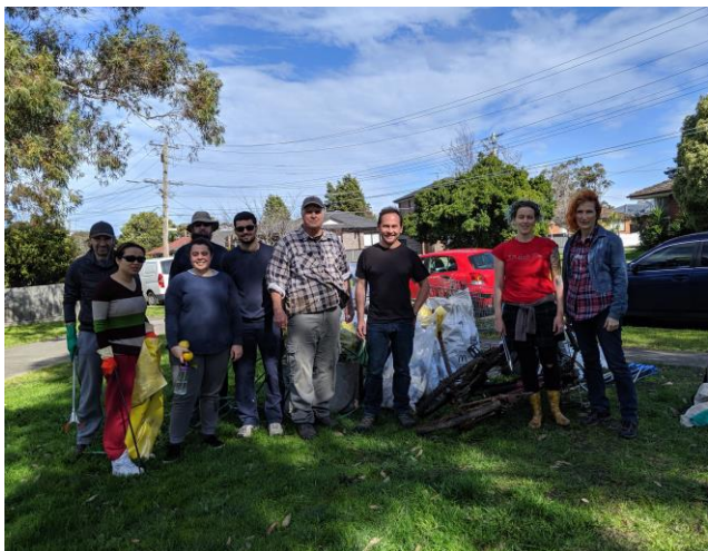
'The clean up crew'

This joint activity reflects a change in focus in planting of the park, initiated by the rangers, with greater focus in the future on smaller plantings and maintaining existing vegetation. We are also keen to participate in other activities in partnership with other groups such as Friends of Darebin Creek.