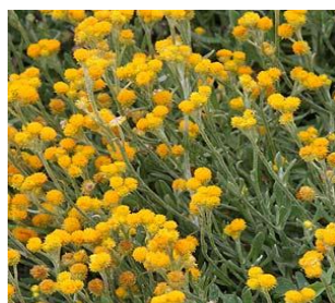
Chrysocephalum sp. Clustered everlasting

Volunteers completed planting from previous years with saltbush, daisies, lilies and kangaroo and poa grasses.