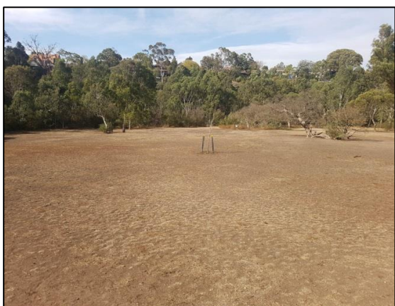
This is what the dog off lead area looks like now

The following photos show the contrast today with a normal year