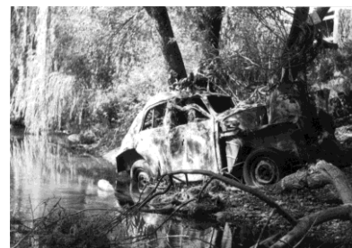
'Clean up Australia Day' circa 1975

We had a small turnout at the March 3rd 'Clean Up Australia Day' Given the oppressive weather [40 degrees] it was amazing anyone turned up at all???? Thanks to Pete and Katy. Clean Up Australia Day is an annual event that DPA and DCMC participates in, keep your eye out next March if you would like to get involved