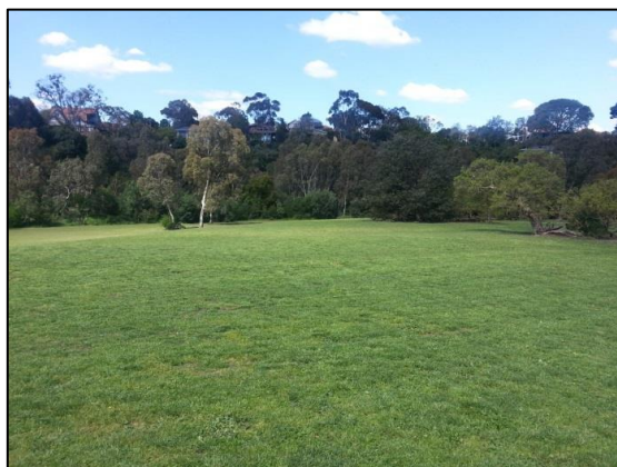
This is what the dog off lead area usually looks like